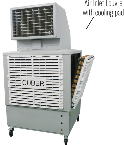
Air Inlet Louvre with cooling pad