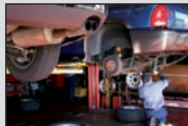
Space Heating is perfect for enclosed workshops and factories

High roofs, open doors / windows & drafts will significantly reduce the performance of space heaters. In these situations radiant heaters are best considered.